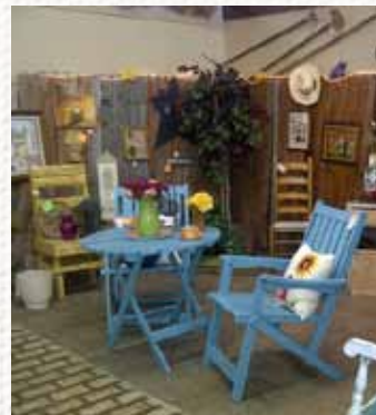
Classy Cactus and Antique Mall